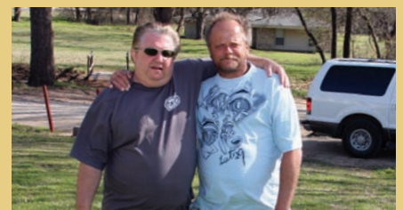
ALPHA Leader and Resident on ALPHA Retreat

In 2010, more than 700 residents participated in Spiritual Development courses, including ALPHA. We have a constant need for more materials and